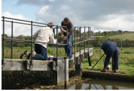
"Volunteers carrying out maintenance work on Rodds Bridge Lock on 4th October"