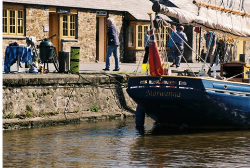
"Bristol Pilot Cutter 'Morwenna' during her visit to Bude on 5th September"