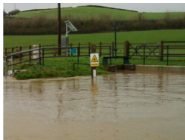
Whalesborough lock and the weir.

The naïve and simple-minded among readers, (myself included), might suppose the surfeit of water described in the preceding paragraph would mean that all is set for a splendid season of navigation on the canal in the coming months with both locks in use for all boats low enough to pass Rodds Bridge and plenty of activity on the little used upper pounds. Not so, alas. We have it on good authority that there is not enough water in the canal for such an extravagance as normal lock use beyond our one-off navigation event in the spring. One wonders how, one hundred and fifty years ago, this same canal carried on a regular trade in and out of the sea lock in all weathers (bar the impossible)