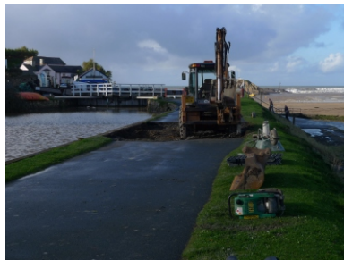
" Remedial work taking place on 21st November following the collapse of the towpath between the Sea Lock and the old Museum building"